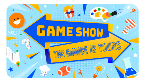
OCTOBER Game Show: The choice is yours