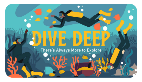
AUGUST Dive Deep: There's always more to explore