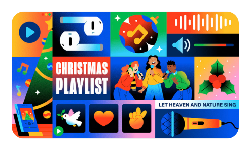
DECEMBER Christmas Playlist: Let heaven and nature sing

NOVEMBER Special Delivery: No postage required