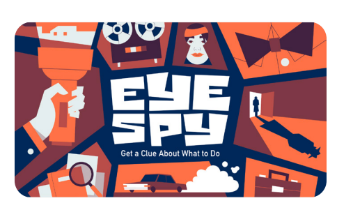
MAY Eye Spy: Get a clue about what to do