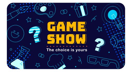
OCTOBER Game Show: The choice is yours