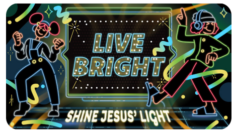
SEPTEMBER Live Bright: Shine Jesus' light