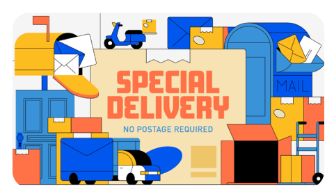
NOVEMBER Special Delivery: No postage required