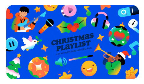
DECEMBER Christmas Playlist: Let heaven and nature sing