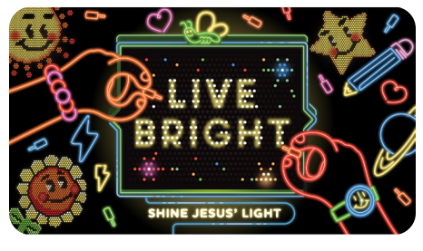
SEPTEMBER Live Bright: Shine Jesus' light