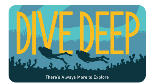
AUGUST Dive Deep: There's always more to explore