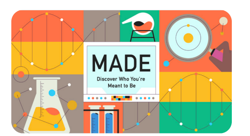
FEBRUARY Made: Discover who you're meant to be