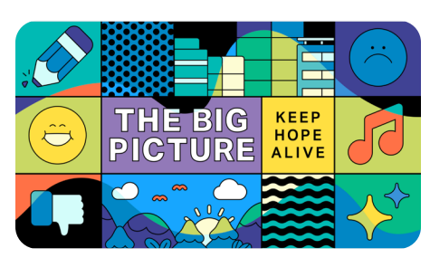
APRIL The Big Picture: Keep hope alive